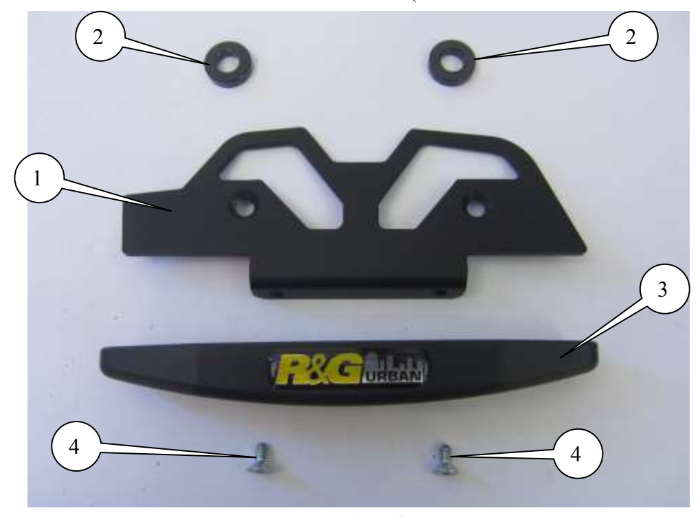
LEFT HAND SIDE

THE PARTS SHOWN MAY BE REPRESENTATIVE ONLY (FOR CLARITY OF INSTRUCTIONS ONLY)