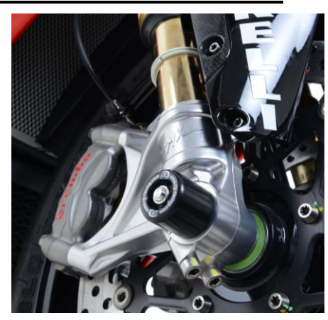
THE ABOVE PICTURES ARE REPRESENTATIVE ONLY