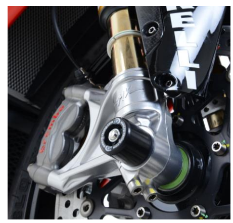
LES PHOTOS CI DESSOUS SONT UNIQUEMENT REPRESENTATIVES