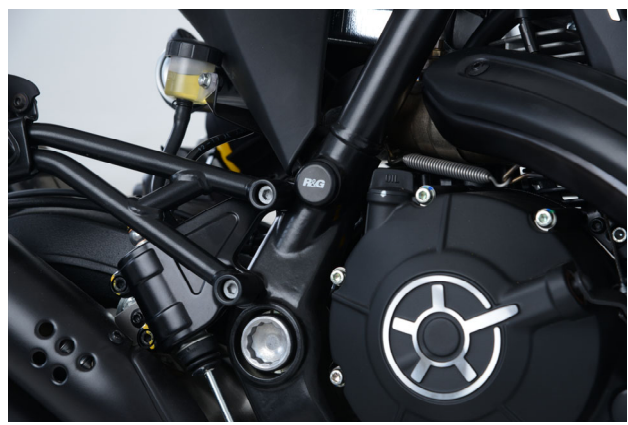
ABBILDUNG 1 ABBILDUNG 2