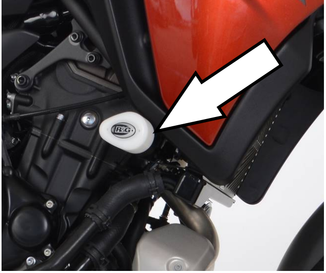
<u>PICTURE A</u> THIS KIT CONTAINS THE ITEMS PICTURED AND LABELLED OVER PAGE.

SOME PARTS MAY BE SHOWN FOR CLARITY OF INSTRUCTIONS ONLY,