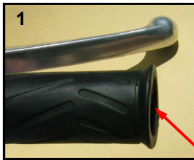
1 Bar Weight Removed