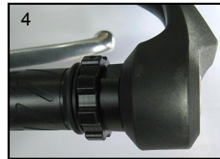
4 KAOKO™ Cruise Control Assembly