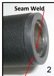
Plastic Thrust Washer