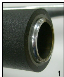
Bar Weight Removed

RSA Registered Designs No. A2007/00202 No. A2007/00205 No. A2007/00203 No. A2007/00206 No. A2007/00204 No. A2007/00207