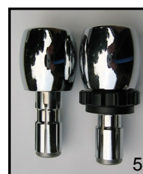
Kit comprises: LHS & RHS weights