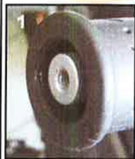
Bar Weight Removed